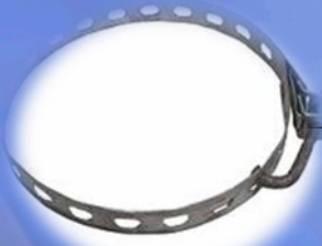
BAP Strap Pole Line hardware